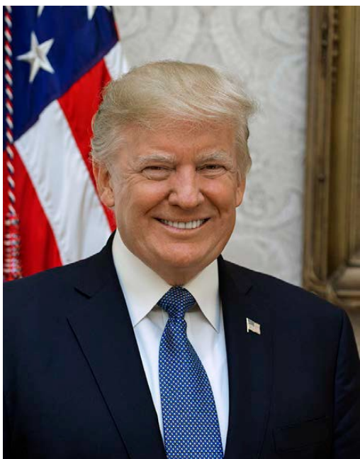
DONALD J. TRUMP President, United States of America

The President can order National Guard personnel to federal active duty during a national emergency and also can mobilize units to support active duty forces performing DoD missions.