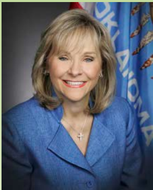
Mary Fallin Governor, State of Oklahoma

The Governor is the commander in chief of the Oklahoma National Guard and, as such, has the authority to activate the Oklahoma National Guard to support and assist local authorities during state emergencies or for homeland defense.